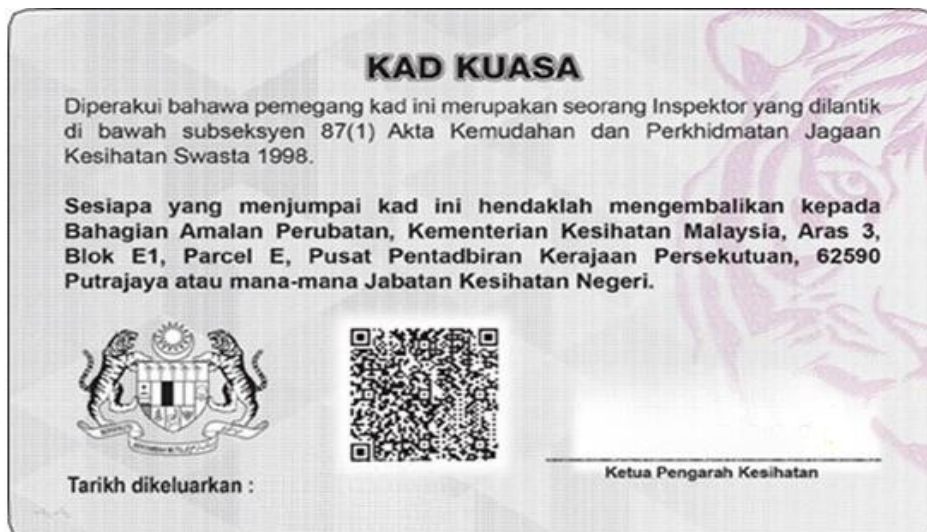
Pandangan bahagian belakang/ Rear view ".

Made 5 June 2024 [KKM-8/A7/A2/29-0(38); PN(PU2)610/VI]