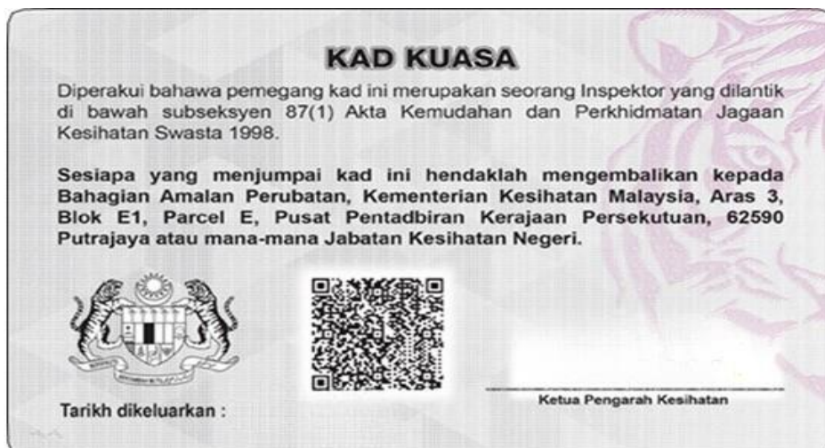
Pandangan bahagian belakang/ Rear view ”.

Dibuat 5 Jun 2024 [KKM-8/A7/A2/29-0(38); PN(PU2)610/VI]