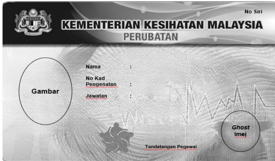
Pandangan bahagian hadapan/ Front view